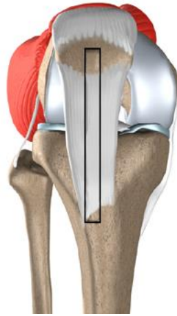
Patellar Tendon Graft